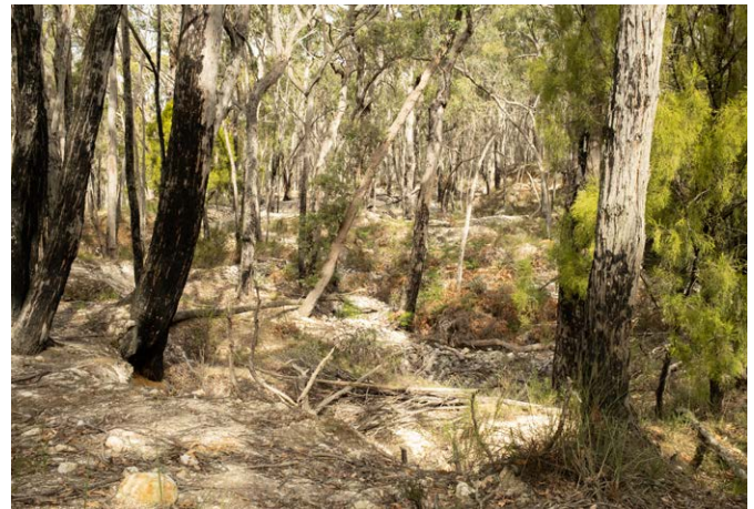
Humbug Hill Hydraulic Gold Sluicing Site

Non-statutory lists and registers do not provide statutory heritage protection but identify places that should be considered as part of the existing conditions. These places may be nominated to statutory registers during planning and delivery of the project.